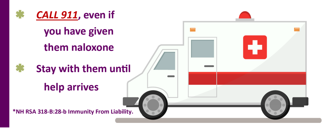
FR-CARA Cooperative Agreement #SP080286.

Don't waste time hiding evidence of drug use - CALL 911